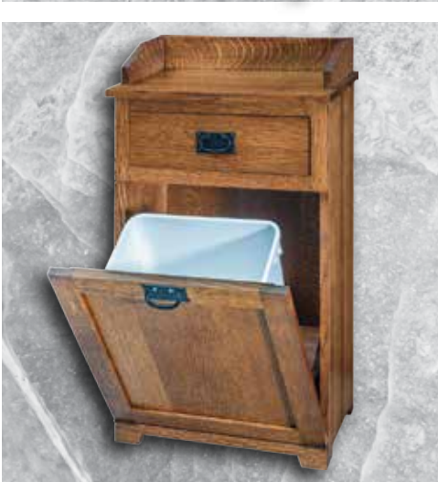
SPECIALIZING IN OCCASIONAL PIECES AND ANY CUSTOM WORK!