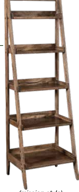
(mission style) Shown in Oak with Carbon Stain