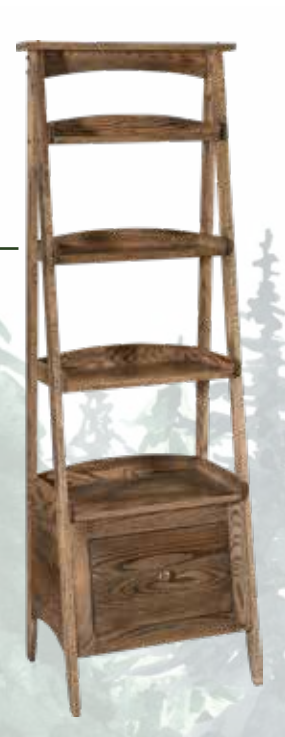
Shown in Oak PINES WOOD CREATIONS