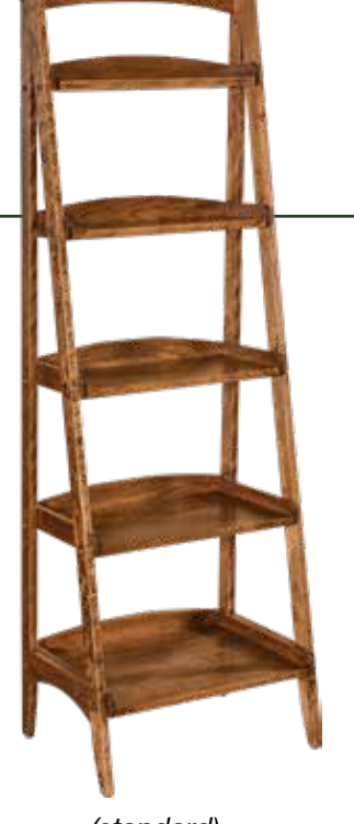
(standard) Shown in Oak

Shown Rough Sawn Brown Maple with Almond 10 Sheen Stain